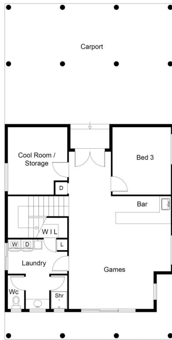
LEVEL 1 PLAN