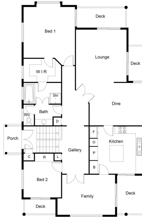
LEVEL 2 PLAN

This floor plan including furniture, fixture measurements and dimensions are approximate and for illustrative purposes only. BoxBrownie.com gives no guarantee, warranty or representation as to the accuracy and layout. All enquiries must be directed to the agent, vendor or party representing this floor plan.