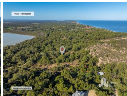
View From North