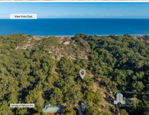
View From East